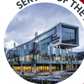
SERVICE OF THE MONTH