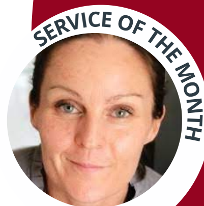
SERVICE OF THE MONTH