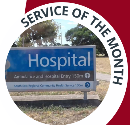
SERVICE OF THE MONTH