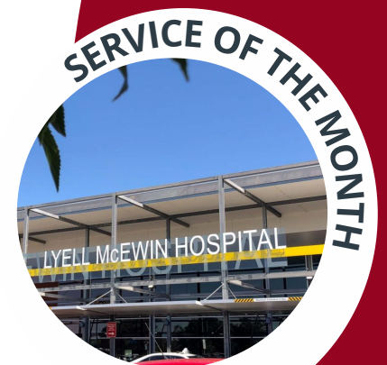
SERVICE OF THE MONTH