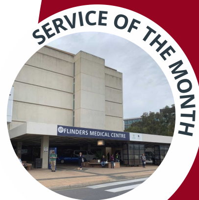
SERVICE OF THE MONTH