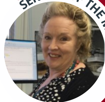
SERVICE OF THE MONTH