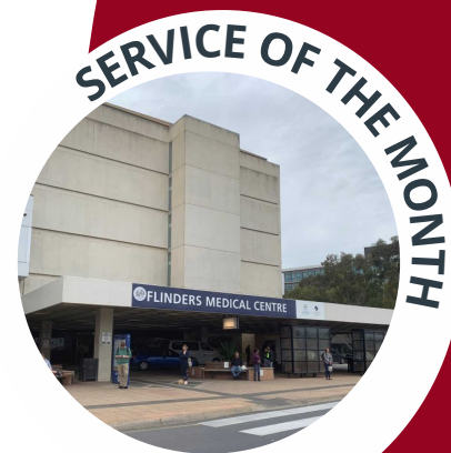
SERVICE OF THE MONTH