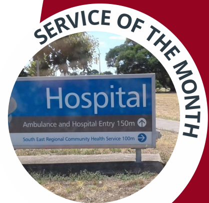
SERVICE OF THE MONTH